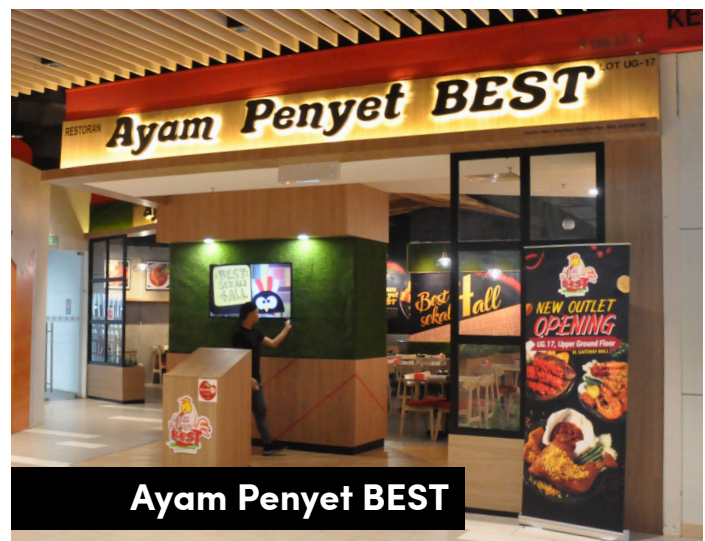
Ayam Penyet BEST